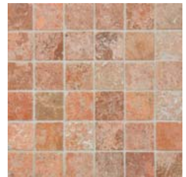
Sunset Travertine Mosaic