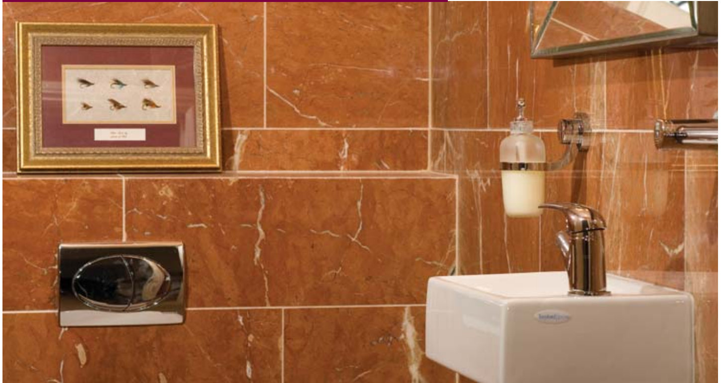
Rojo Alicante Marble

I'm trying to do my little bit for the environment and will only be sending my press release via email from now on.